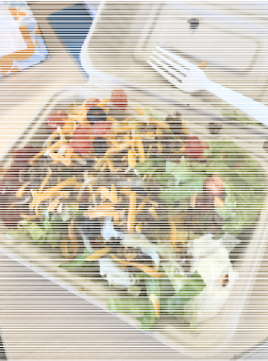
Students enjoyed their Nacho it Up Salad.